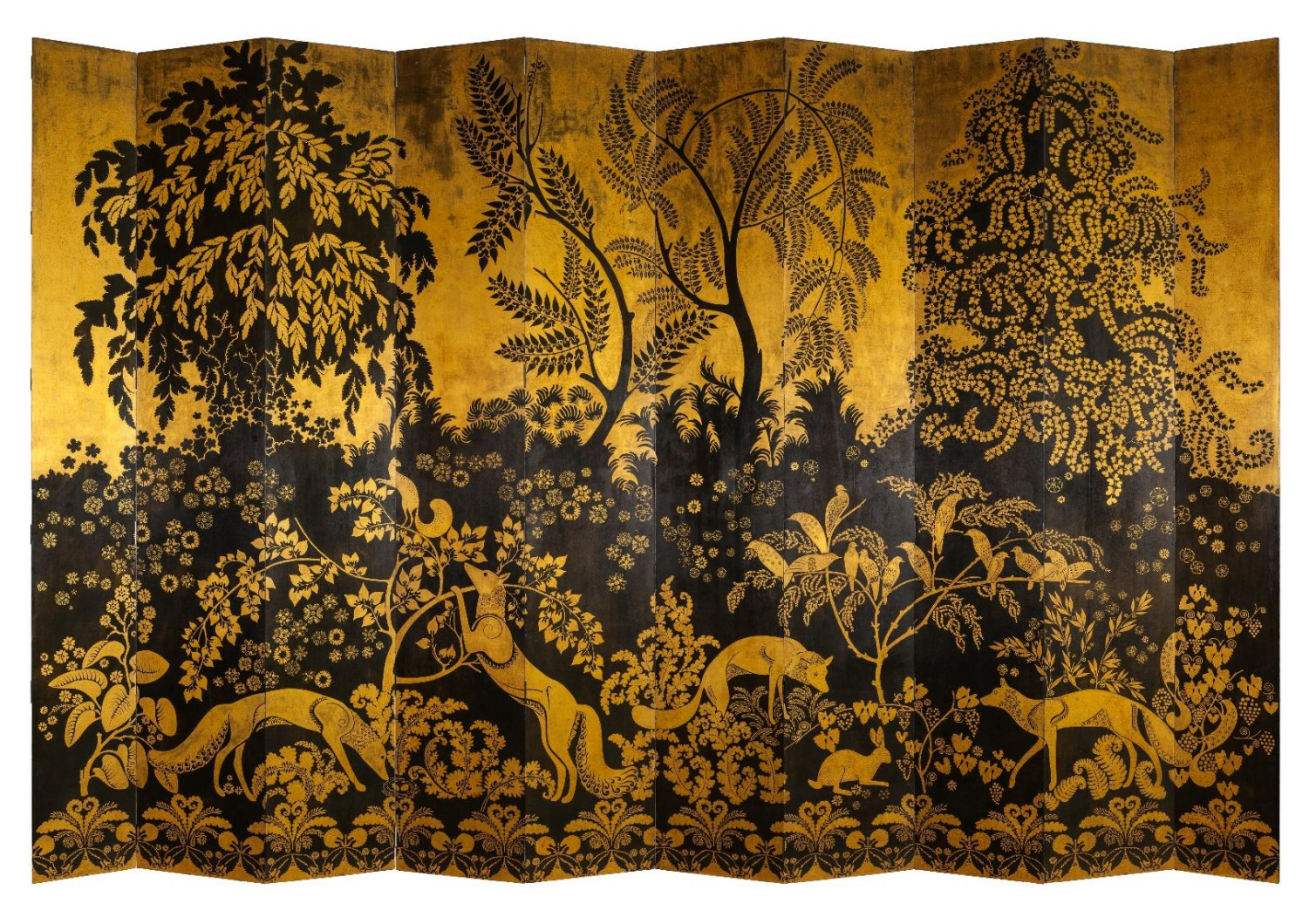
10,000 Years of Luxury (October 30, 2019 - February 15, 2020) nand-Albert RATÉAU, Ten-panels screen Renards 1921 – 1922, Musée des Arts Décoratifs