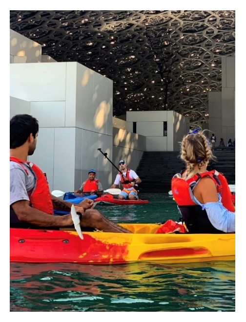
Kayaking activity at Louvre Abu Dhabi

As part of the regular programming, the museum continues to offer a range of activities and programmes to explore in new ways, the museum, its collection, and its exhibitions. These include guided tours, workshops (as well as interactive digital workshops), digital commissions, master classes, conferences and talks, film screenings, family weekends, and also architectural kayaking tours.