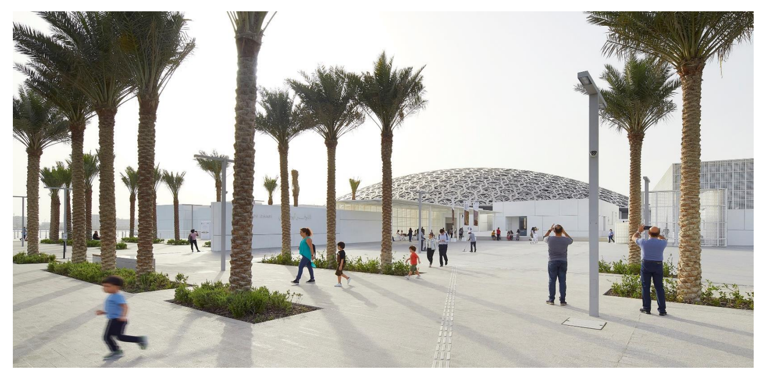
Louvre Abu Dhabi