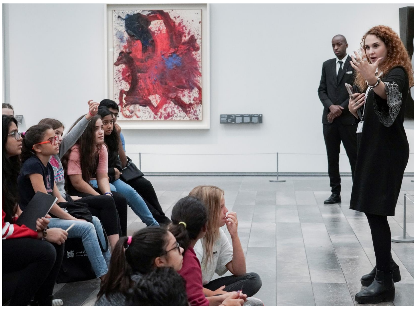
Storytellers Inside the Exhibition