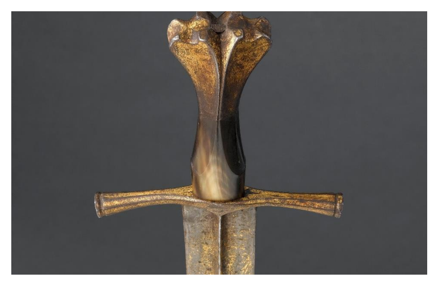
Furusiyya: The Art of Chivalry between East and West (February 19, 2020 – May 30, 2020) exhibition Sword of Duke of Milan, Milan, Italia, second half of the 15th century, Iron, gilded steel, horn, H.113 W.14.7 cm, France, Paris, Musée de Cluny, Cl. 11821

"In Changing Societies, our main objective is to shed light on how culture and creativity have acted as a manifestation of shifts and changes in society and civilisations."